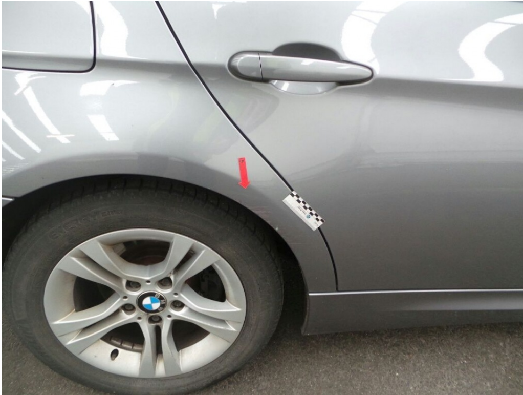
5. Sidewall - Rear - right