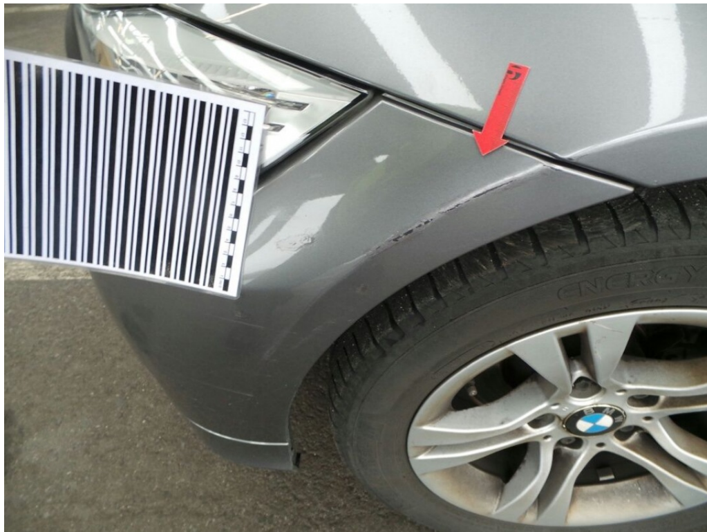
1. Front bumper