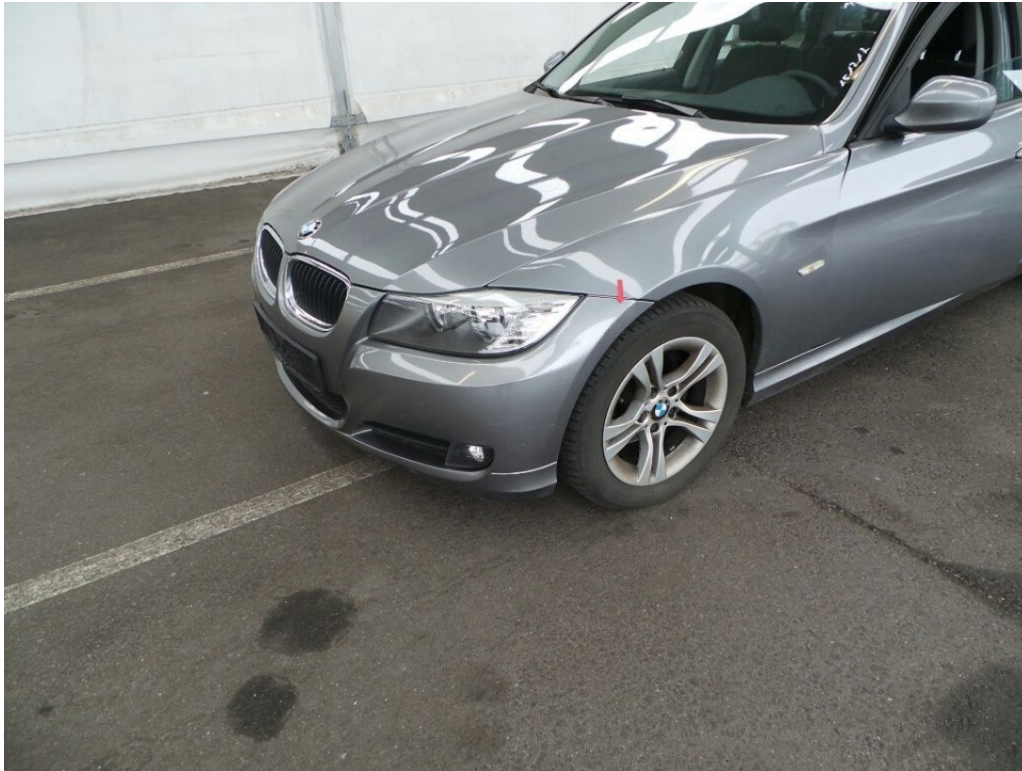
1. Front bumper