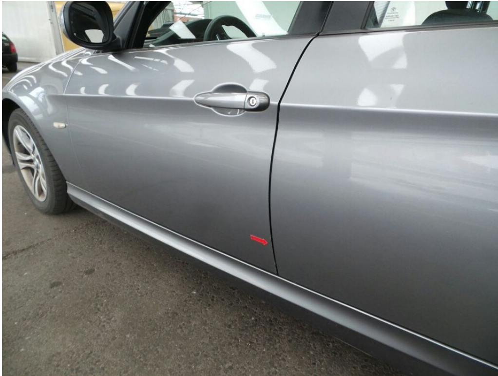
3. Front door - left