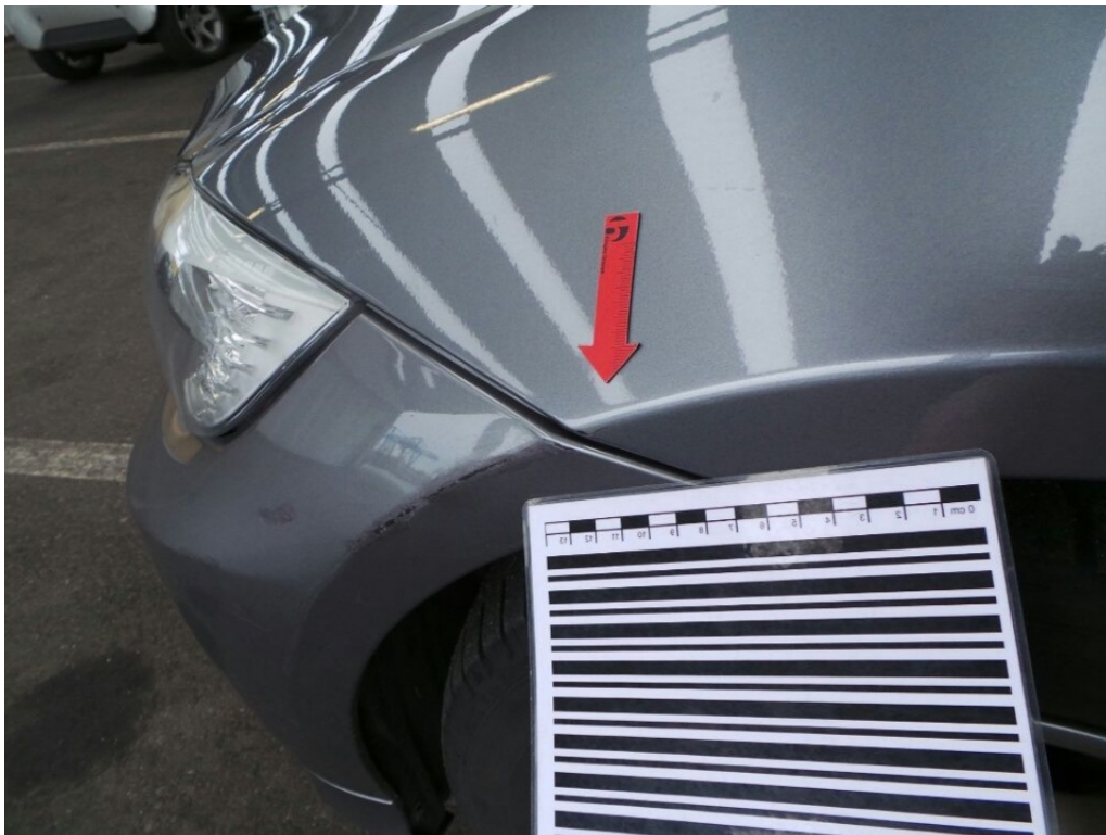
2. Front fender - left