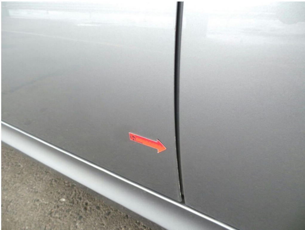
3. Front door - left