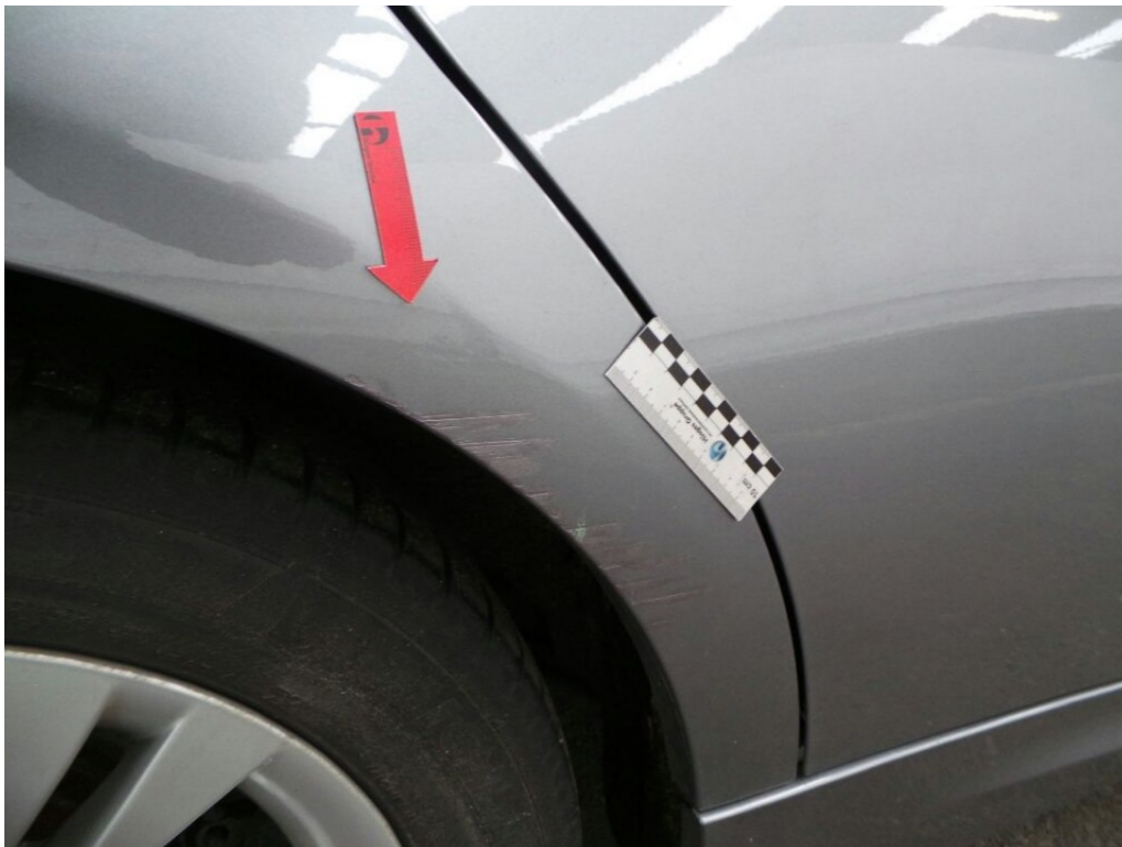
5. Sidewall - Rear - right