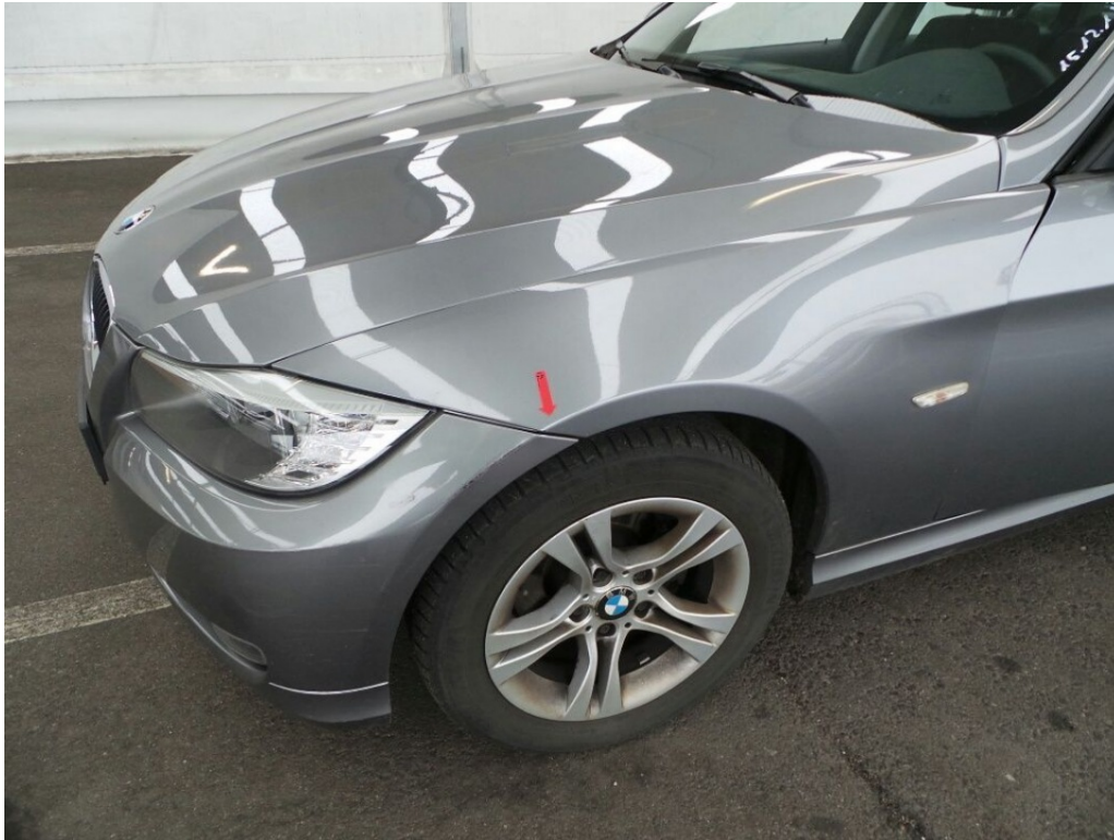
2. Front fender - left