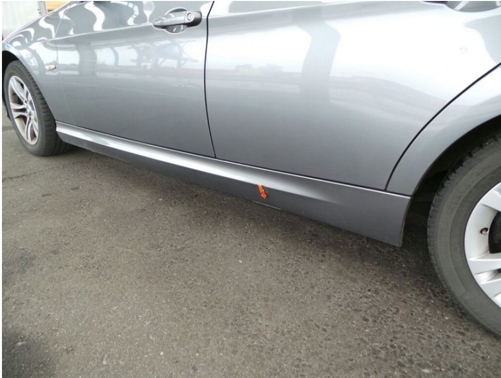
4. side skirt - left