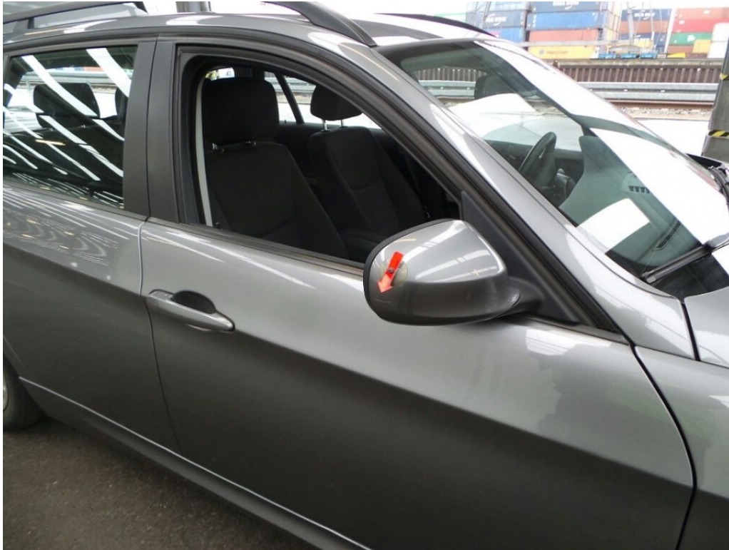
6. exterior rear view mirror shell - right