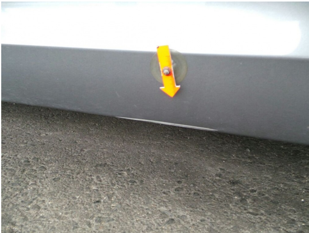
4. side skirt - left